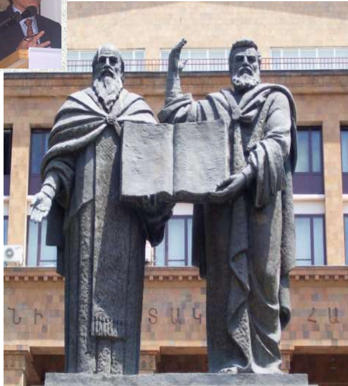
The statues of Mesrop Mashtots and Sahak Partev (sculptor Ara Sargsian) erected in 2002, at the entrance to the YSU main building

ISBN: 978-1-927860-54-0 www.Edic-Baghdasarian.com