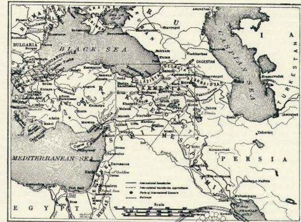
Map showing the boundaries of Armenia as awarded by PRESIDENT WILSON.